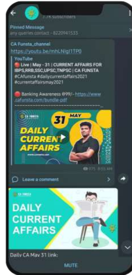
CA Funsta Channel