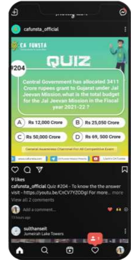
CA Funsta Channel