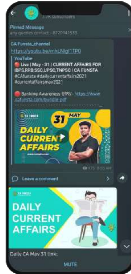
CA Funsta Channel CA Funsta-Mission Parents