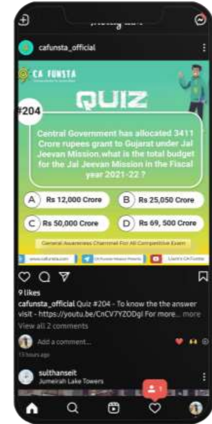
CA Funsta Channel