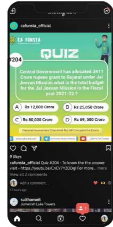
CA Funsta Channel