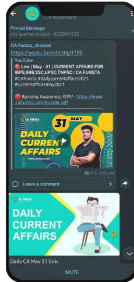
CA Funsta Channel CA Funsta-Mission Parents