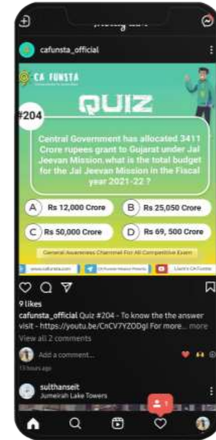
CA Funsta Channel