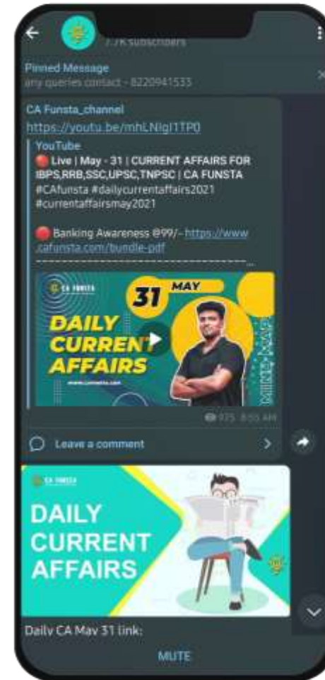
CA Funsta Channel CA Funsta-Mission Parents