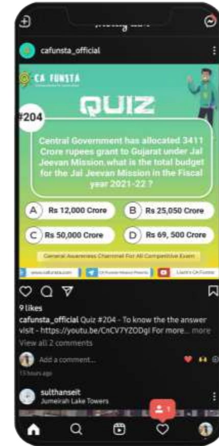
CA Funsta Channel