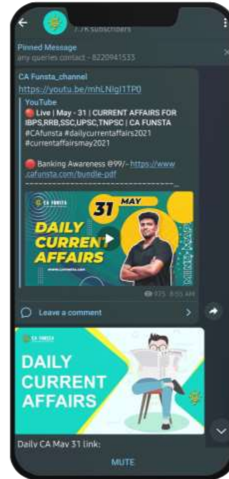
CA Funsta Channel CA Funsta-Mission Parents