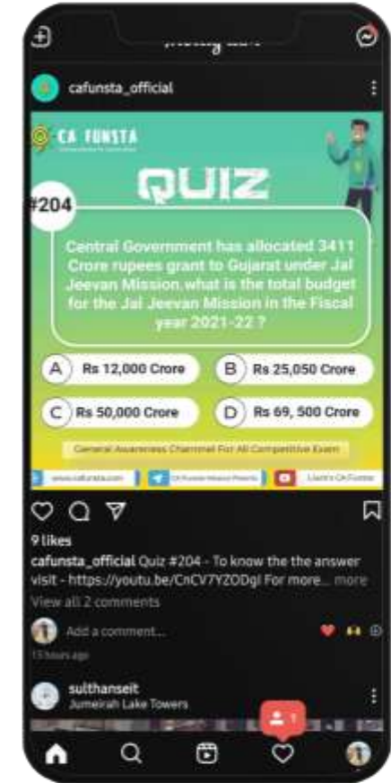
CA Funsta Channel