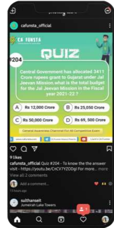
CA Funsta Channel