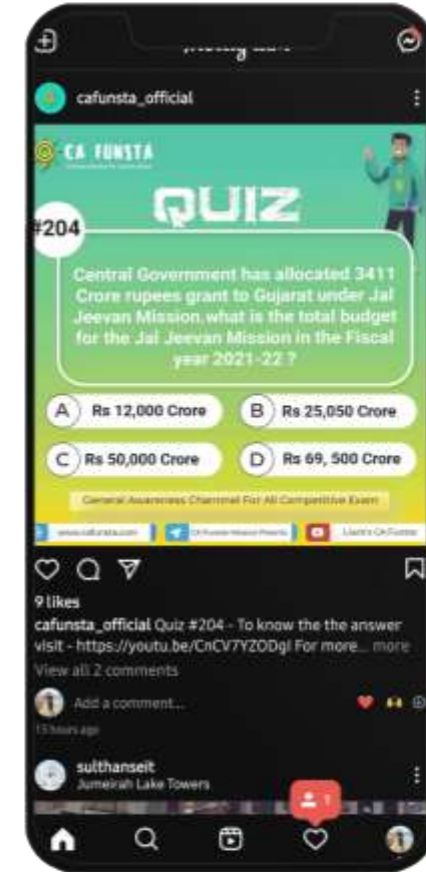
CA Funsta Channel