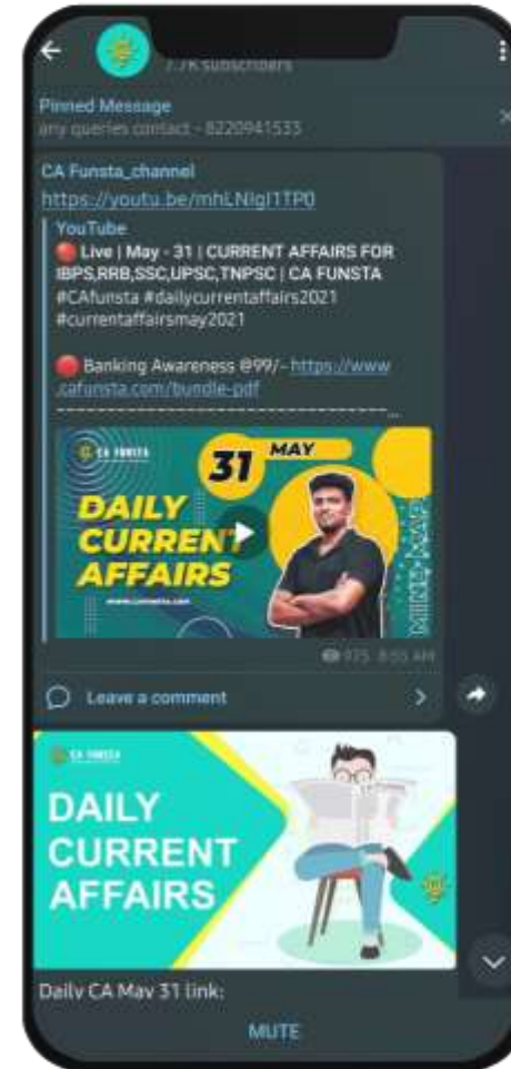
CA Funsta Channel