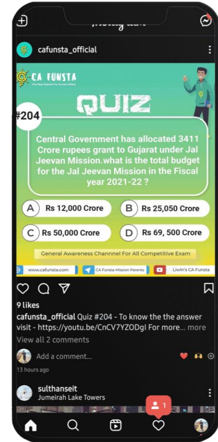
CA Funsta Channel