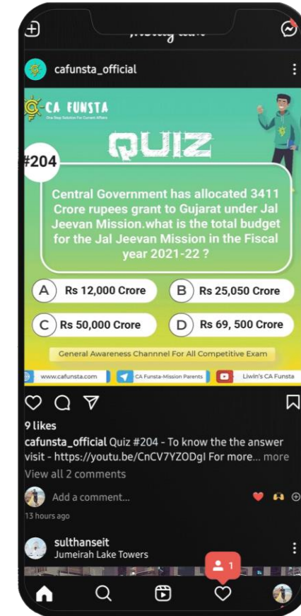
CA Funsta Channel