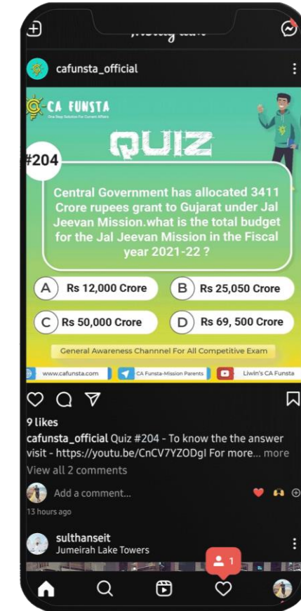
CA Funsta Channel