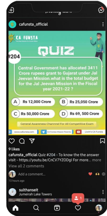
CA Funsta Channel