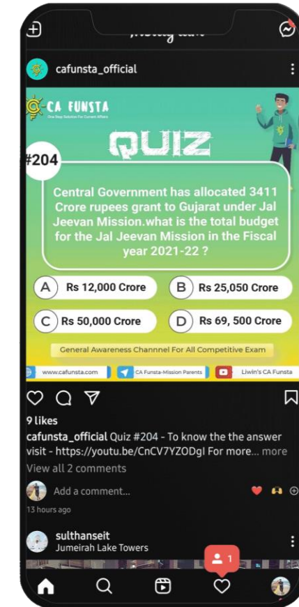
CA Funsta Channel