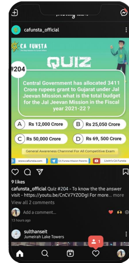
CA Funsta Channel