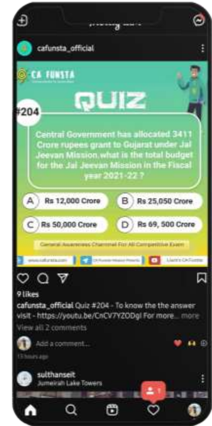
CA Funsta Channel