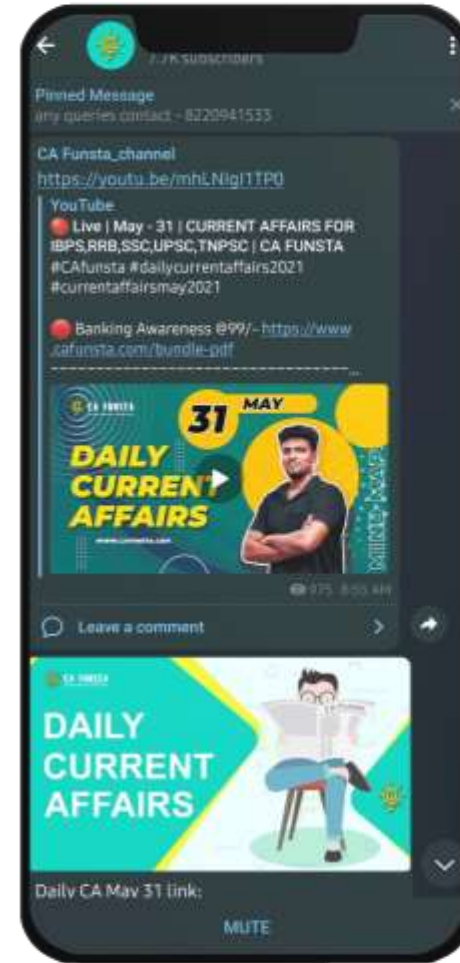
CA Funsta Channel CA Funsta-Mission Parents