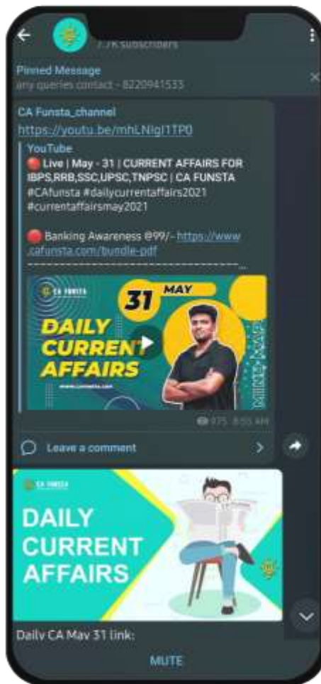
CA Funsta Channel