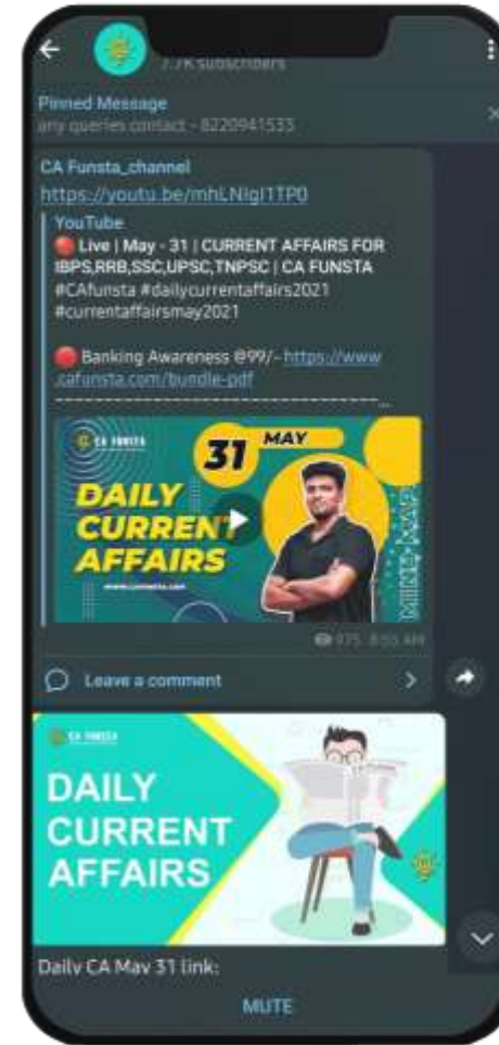
CA Funsta Channel