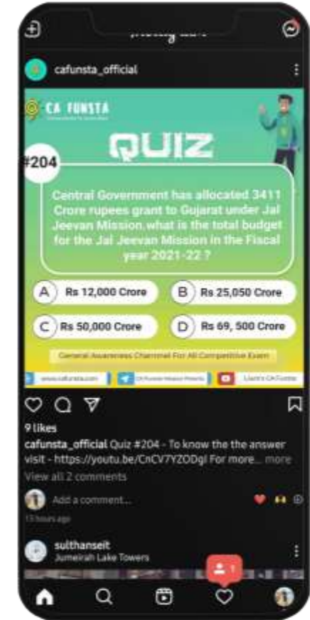
CA Funsta Channel